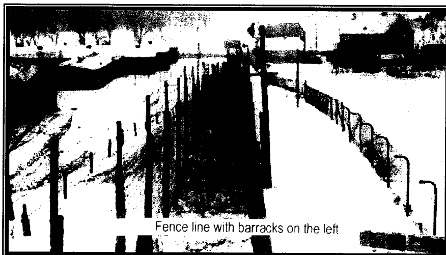
Fence line with barracks on the left