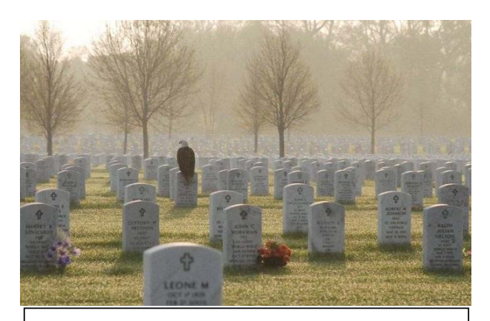
Our national symbol standing guard at the National Cemetery in Minneapolis on a beautiful morning.