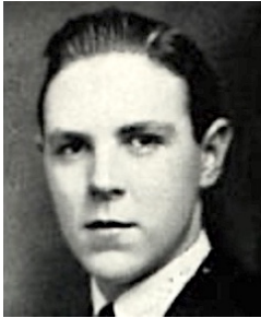
1937 Princeton Yearbook