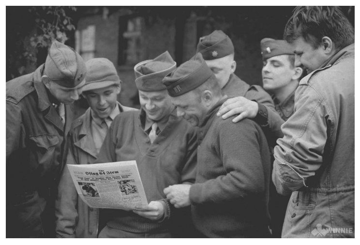
2017 Reenactment Photo