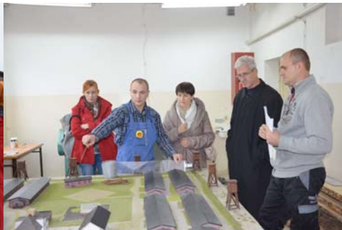
A visit to the scale model of the camp