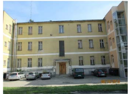
Rear of White House where "Appel" was held