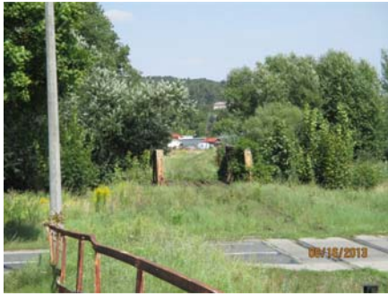
Train track that brought Kriegies from Bydgoszcz Poland to Szubin