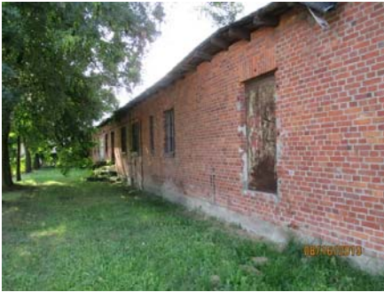
One of the remaining barracks from the outside