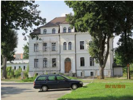
Former Oflag 64 Hospital now being renovated as an office building