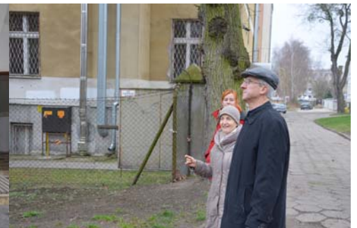
Looking at the back side of the White House