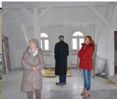
A look inside the Oflag 64 hospital being renovated for office space