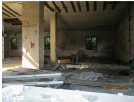
Inside one of the remaining barracks