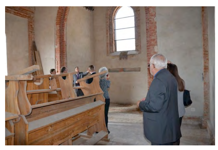
Inside the Oflag 64 Chapel (in the process of being renovated).