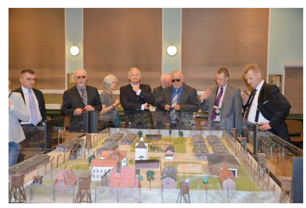
Visiting the Scale Model of Oflag 64 in the main hall of the Reform School.