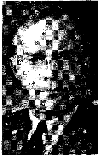
U.S. Army, 1963