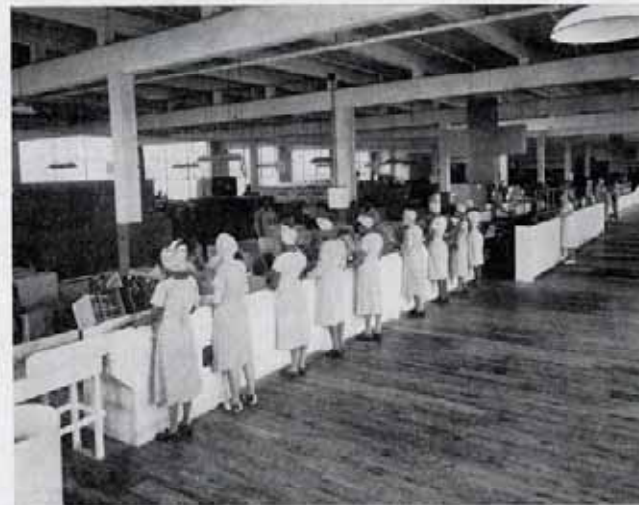
The Wm. Wrigley Jr. Company in Chicago using one of its assembly lines for packing prisoner of war packages for the American Red Cross.

This public-spirited action on Mr. Wrigley's part has been greatly appreciated by the American Red Cross, which was thereby able to augment its own assembly operations in Chicago during the month of May to the extent of 125,000 prisoner of war food packages—the total packed in Chicago during that month being approximately 500,000.