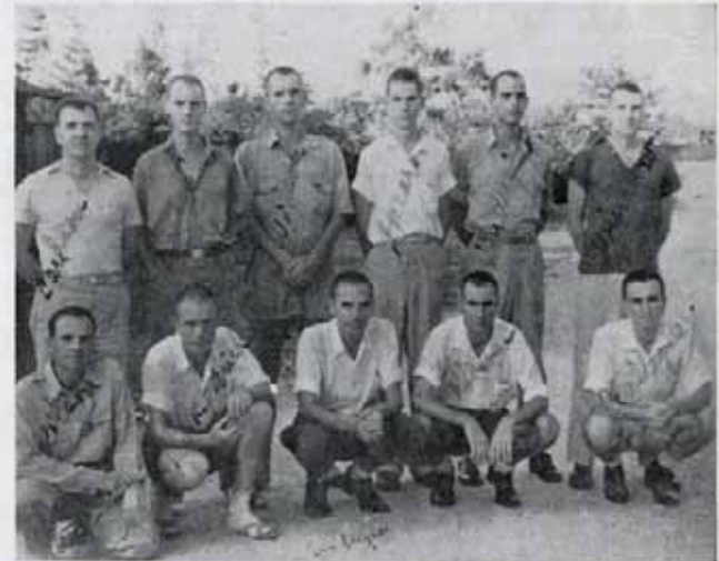
American prisoners of war at Zentsuji. This group includes five aviators from the U. S. S. Houston

Sports space is provided for baseball, cricket, and deck tennis, with a "gymnastic excursion" outside the camp once a week. Radio is available for local reception, and a library of some 500 books was obtained from