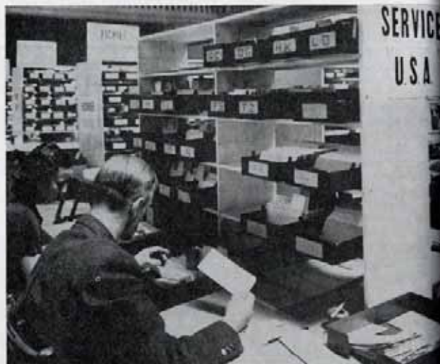
The Central Agency of the International Red Cross Committee at Geneva card-indexes all prisoners of war. This picture shows the American Section.