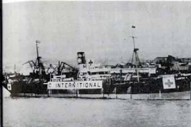
Red Cross ship Caritas I at a European Port.

In view of the reduced volume of neutral trans-Atlantic cargo available, and the pressure of various Red Cross societies for additional space as the number of prisoners increased, the International Committee asked the belligerent Powers