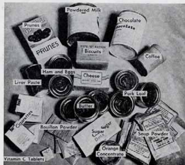
Contents of the invalid food parcel packed by Red Cross volunteers in the New York Packing Center. This parcel is for prisoners recovering from illness or wounds.