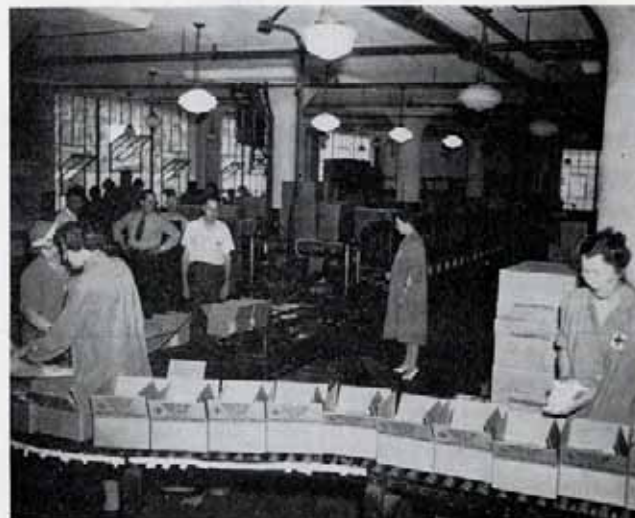
Four months after its official opening on March 3, 1943, the Red Cross Packing Center No. 1, in Philadelphia, had made up over 700,000 prisoner of war food packages.

practical proof that he or she is more nearly related than a first cousin to a prisoner, other than American or British, held in Italy.