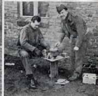
Outdoor cooking in the base camp at Furstenberg.