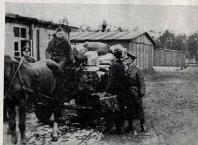
International Committee Delegate and German camp authorities watch arrival of mail and parcels for American prisoners at Stalag III B (February 1944).