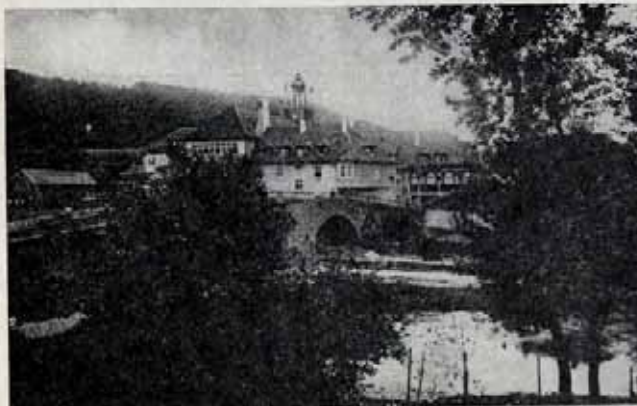
Reserve Lazaret, Obermassfeld, dependent on Stalag IX C at Bad Salsza in central Germany. A delegate of the International Committee of the Red Cross, who visited Obermassfeld in March 1944, reported by cable that the lazaret contained nearly 200 sick or wounded American prisoners of war (including 120 officers) and over 300 British.

Information regarding cable service to the Far East may be obtained from Red Cross chapters.