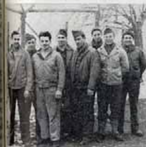
Group of men attached to Work Detachment No. 4.