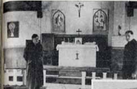
Chapel, built by American prisoners. Left, Catholic priest. Right, enlisted man who serves as Protestant chaplain.

These pictures were taken on February 28-29, 1944, by a Delegate of the International Committee of the Red Cross)