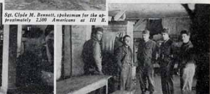
Spokesmen and assistants spokesmen of Work Detachments Nos. 2, 3, and 4 in their sleeping quarters at Schulen.