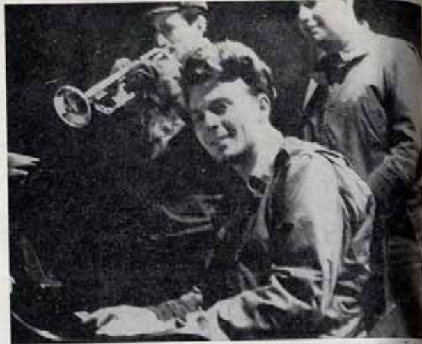
Unidentified American musicians at Stalag III B, February 29, 1944.

Life goes on pretty much the same as before, days roll by in an endless procession with little or no change. Naturally, I'm looking forward to being free as we are all.