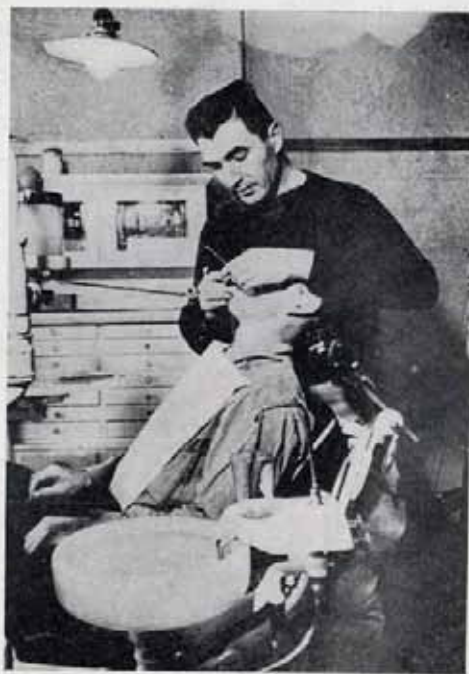
U. S. dental surgeon at work in his office in the prisoner of war camp at Shanghai. The dental equipment was provided by the American Red Cross.

The Delegate visited Fukuoka Branch Camp No. 17 on April 21. On the day of his visit there were 501 prisoners, 111 Americans. Ten of the prisoners were officers and the remainder were enlisted men, all of whom had been captured in the Philippines. The camp was opened July 8, 1942. Although the exact geographical location of this camp was not given, it is stated to be situated on a wooded ground near the