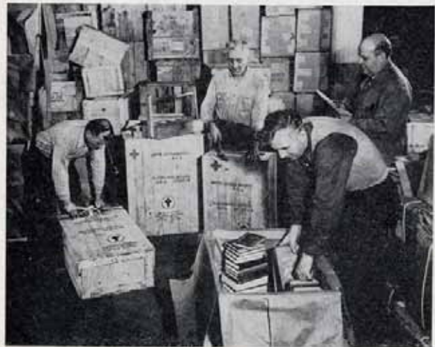
Packing articles for prisoners of war and interned civilians at the warehouse of War Relief Services of the National Catholic Welfare Conference.