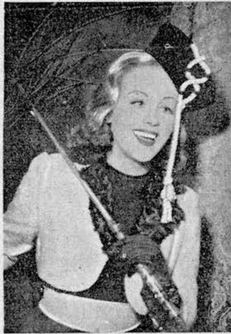
This lovely creature is a German peacetime product, a nice contrast to such local wartime items as barbed wire, black bread and 88's. Peace it's wonderful. We don't know her name. Does it matter?