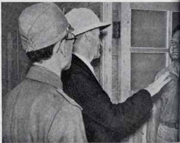
Under Japanese escort, the Shanghai Delegate of the International Red Cross Committee visits prisoner of war camps.