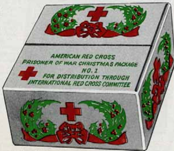
Ten thousand of these special packages were shipped to Europe for distribution to American prisoners at Christmas.

specially made up to meet exceptional requirements. These Gripsholm supplies, which were transferred to a Japanese ship at Mormago under International Red Cross Committee supervision, were unloaded during November at the designated points in the Far East. Assuming no undue delays have occurred, there has thus been ample time for the food, clothing, medicines, and other supplies to reach the men in the Far East camps by Christmas.