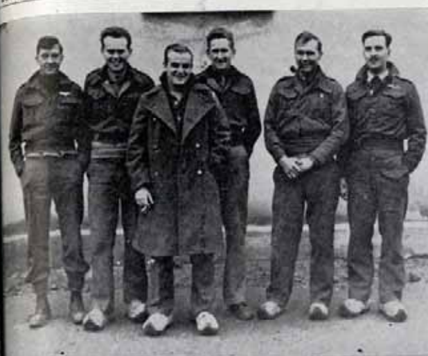
American "veterans" at Stalag Luft III. The wooden shoes worn by these flyers were issued by the German authorities. Many prisoners are said to prefer wooden to leather shoes for winter wear.

(Note: Many of the Japanese "camps" in industrial areas appear to be merely barracks or buildings used for housing prisoners of war rather than encampments. Ed.)